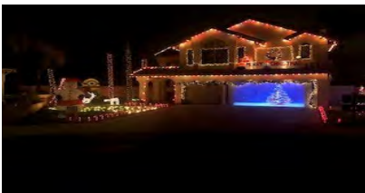
2nd Place went to 1 Coppercrest