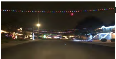
Most Festive Street went to Grandbriar