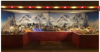
Honorable Mention went to 15 Eaglepoint

We know how much effort, work, time and money it takes to create these wonderful lighting displays and we thank you ALL for making the community come alive in holiday lighting!