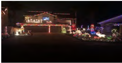
1st Place went to 3 Coppercrest

Everyone who decorated this year, did an amazing job. It's great to see the community come together to make the Pacific Ridge holiday season festive. There are 655 homes in the Pacific Ridge Community, so each year is extremely difficult to decide who had the best holiday lights and decorations. Everyone should know that no matter how many lights or decorations you had on your home, every single one looked amazing.